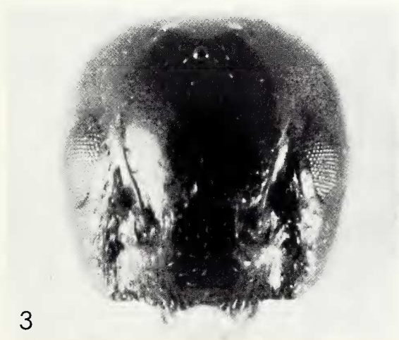
Figure 3. Head capsule of a gynomorph of Dolichoderus taschenbergi , collected on a sandy ground after nuptial flight in Port Kent, Clinton, Co., New York, 1965-VII-02, AF-04783.